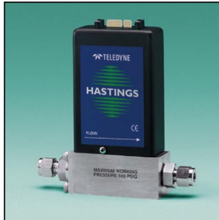
HFM-E-200 / HFC-E-202